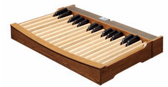
30 notes straight concave for CLV 4 model