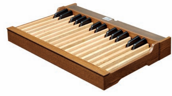
30 notes straight for CLV 4 model