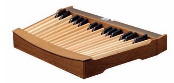
32 notes radiating concave for CLV 8 / CLV 7 / CLV 6 models