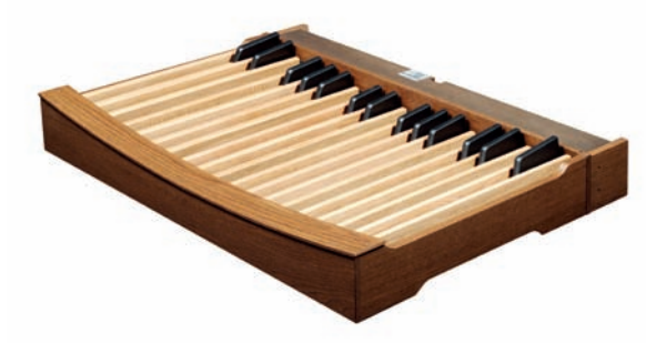
32 notes straight concave for CLV 8 / CLV 7 / CLV 6 models